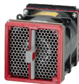
2U Hot swap fan modules