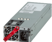
2.4kW Hot swap power supplies