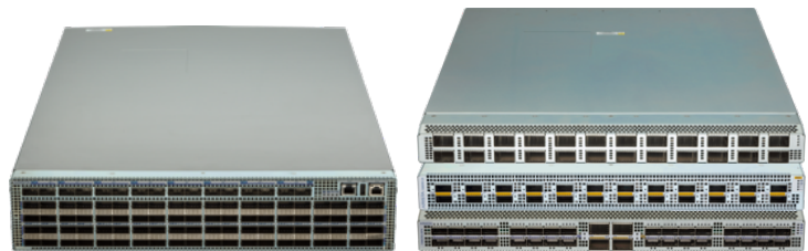
Arista 7280R3 Series

7280R3 support for 100G QSFP incorporates a flexible choice of interface speed including 25G and 50G providing unparalleled flexibility and the ability to seamlessly transition data centers to the next generation of Ethernet performance. The 7280R3 Series provide industry leading power efficiency with airflow choices for back to front, or front to back. An optional built-in SSD supports advanced logging, data captures and other services directly on the switch. Combined with Arista EOS the 7280R3 Series delivers advanced features for big data, cloud, virtualized and traditional designs.