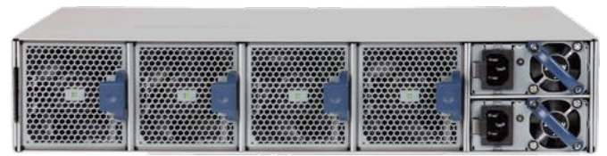
Arista 7050X 2RU Rear View: Rear-to-front airflow model (blue)