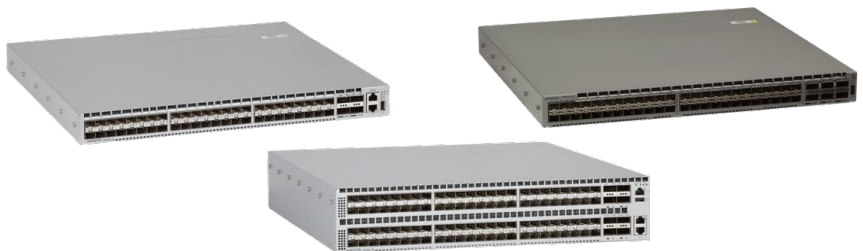
Arista 7050SX Series of 1/10GbE and 10/40GbE Switches Top left: 7050SX-64, right: 7050SX-72, bottom: 7050SX-128

Combined with Arista EOS the 7050X Series delivers advanced features for big data, cloud, virtualized and traditional designs.