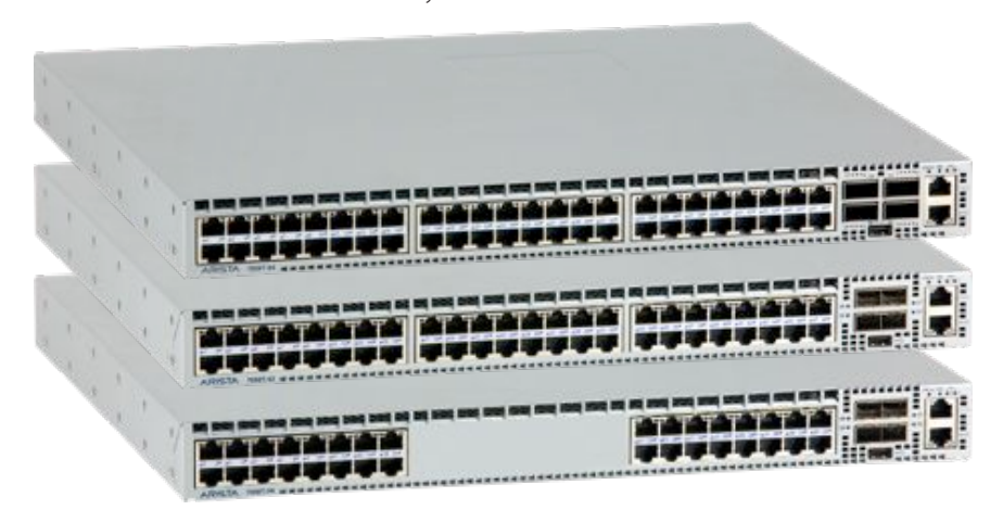
Arista 7050T: 32 or 48 x 1/10GbE BaseT ports and 4 x 1/10GbE SFP+ or 4 x 40GbE QSFP+ ports

The Arista 7050T switches offers flexible support for triple speed 100Mb, 1Gb and 10Gb Ethernet together with a shared 9 MB packet buffer pool that is allocated dynamically to ports that are congested. With a typical power consumption of less than 6 watts/port the 7050T Series provides industry leading power efficiency for the data center. An optional built-in SSD supports advanced logging, data captures and other enhanced services directly on the switch.