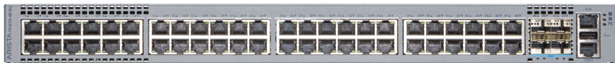
Arista 7010TX-48-DC: 48 port 10/100/1000 and 4 port 10/25GbE Switch