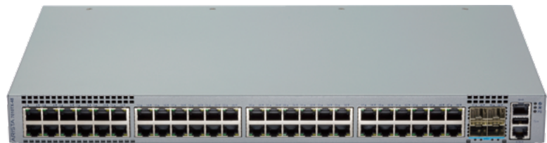
Arista 7010TX-48, 7010TX-48C and 7010TX-48-DC:

Combined with Arista EOS, the 7010X Series delivers the flexibility and features for scale out applications in cloud, virtualized and traditional network designs and accommodates the myriad different applications and east-west traffic patterns found in modern data centers.