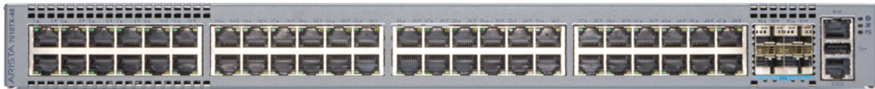
Arista 7010TX-48 and 7010TX-48C: 48 port 10/100/1000 and 4 port 10/25GbE Switch

Each of the four SFP ports supports a choice of speeds with flexible configuration between 1GbE, 10GbE, or 25GbE. All ports can operate in any supported mode without limitation, allowing easy migration from lower speeds and the flexibility for deployment over existing fiber infrastructure.