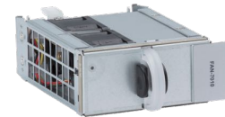
Arista 7010T hot swap and reversible fan module