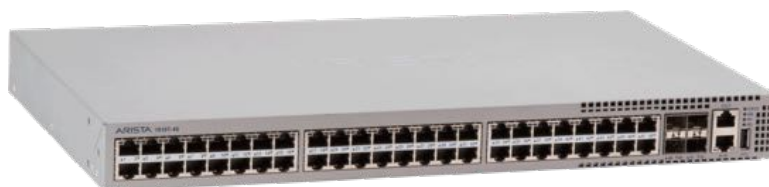
Arista 7010T-48: 48 port 10/100/1000 and 4 port 10GbE Switch

Consuming under 52W the 7010T are extremely power efficient at less than 1W per port. Built in power redundancy and customer reversible redundant fans allows cooling airflow in either forward or reverse direction in a single system.