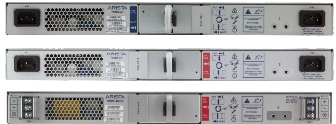
Arista 7010T Rear View - reversible airflow, AC & DC