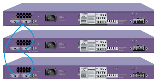
Figure 1: Summit 400-24t UniStack Stack Cabling Illustration