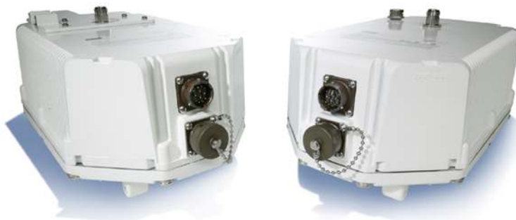
Figure 1. Cisco Aironet 1500 Series

The Cisco Aironet 1500 Series supports options for dual-band, simultaneous support for IEEE 802.11a and 802.11b/g standards with the 1510 model or single-band support for IEEE 802.11b/g with the 1505 model. Both models employ Cisco's patent-pending Adaptive Wireless Path Protocol (AWPP) to form a dynamic wireless mesh network between remote access points, while delivering secure, high-capacity wireless access to any Wi-Fi-compliant client device (Figure 2).