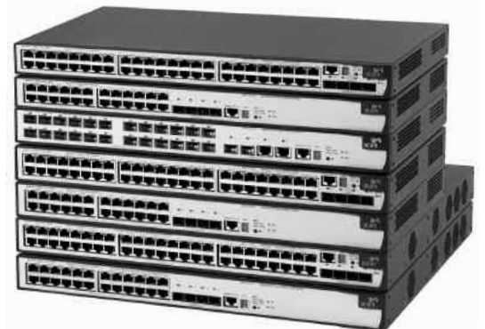
from top: 3Com Switch 5500-SI 52-Port, Switch 5500-SI 28-Port, Switch 5500-EI 28-Port FX, Switch 5500-EI 52-Port, Switch 5500-EI 28-Port, Switch 5500-EI PWR 52-Port, Switch 5500-EI PWR 28-Port

Enterprises can select Standard-Image (SI) or Enhanced-Image (EI) versions. EI models offer expanded capabilities and provide additional switching features: more MAC addresses, static routes and IP interfaces, greater number of virtual LANs (VLANs), extended port mirroring, Layer 3 OSPF routing, 3Com XRN stacking technology and IEEE 802.3af Power over Ethernet (PoE) support.